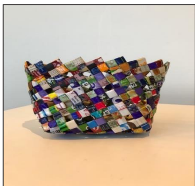
Tote bag (waiting on handles)

Once you have the technique you can make useful household items and gifts such as trivets, baskets, bags and many other inspiring options.